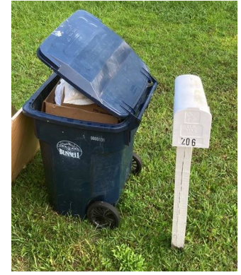
TOO CLOSE TO OBSTRUCTION