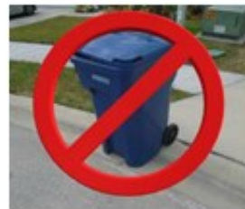
DO NOT PLACE IN ROAD