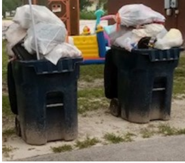
DEBRIS IN CART TOO HIGH